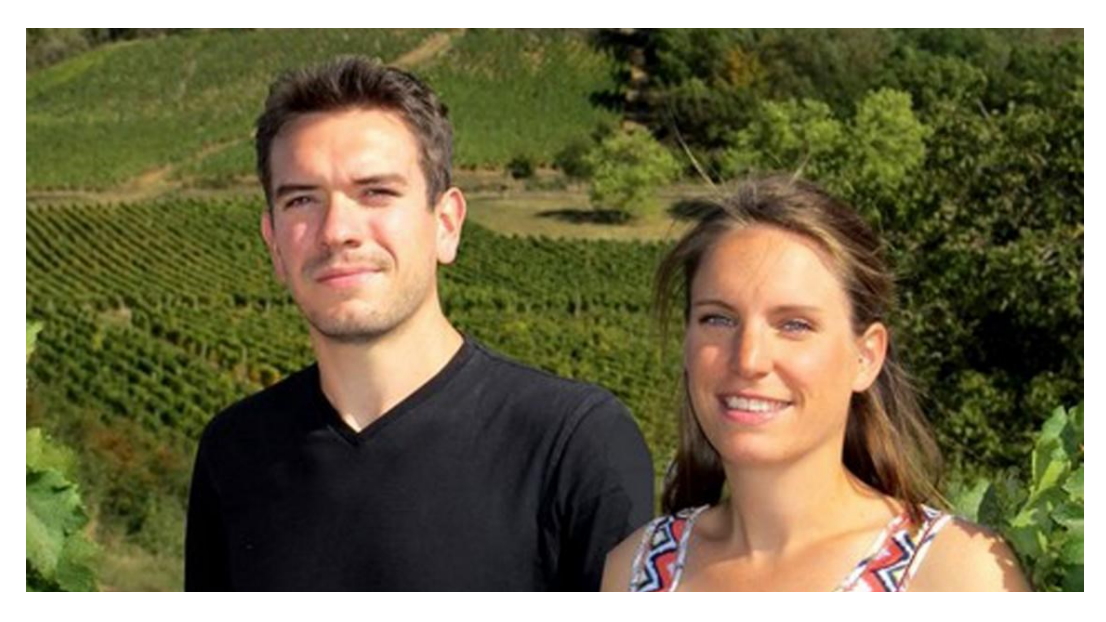
TABLE 22: DOMAINE SÈVE Mâconnais

Domaine Sève is a small but impeccable family property that lie on the steep slopes overlooking Solutre, one of the finest of all the Macon Villages and the very core of the appellation. Siblings Mathilde and Antoine Sève, the current generation, use oak carefully not to create oaky flavours but to allow an exchange between oxygen and the developing wine, with spectacular results.